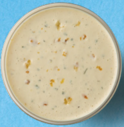
HOT HONEY RANCH