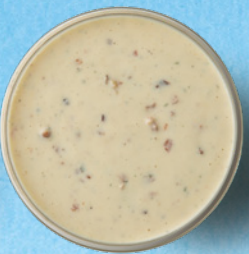
BACON JALAPEÑO RANCH